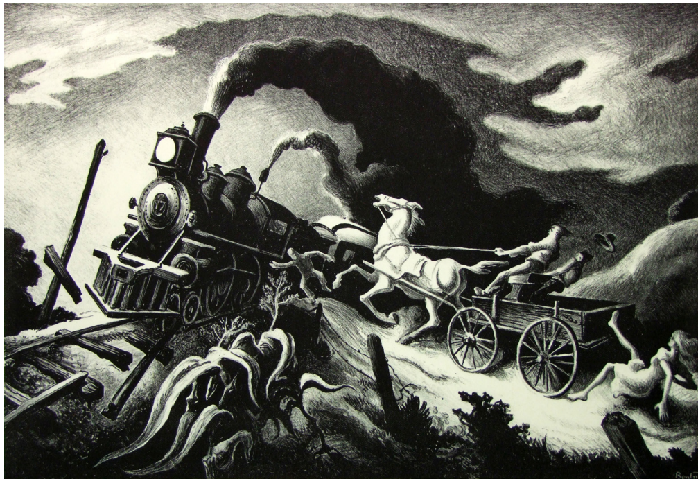
Thomas Hart Benton | WRECK OF THE OLD '97 | lithograph