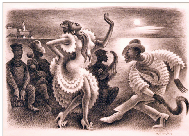
Clockwise from left: JOHN BROWN by John Steuart Curry, RUMBA by Miguel Covarrubias, APPROACHING STORM by Grant Wood